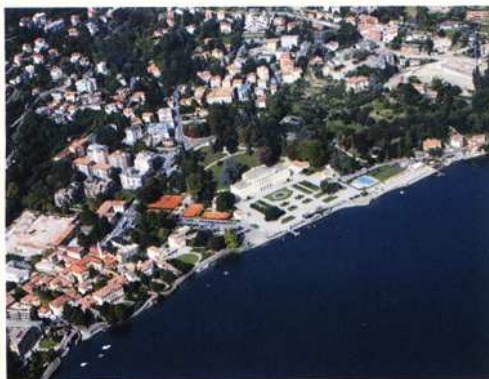
Como, the new base of Yachtcharter Sneek in Italy.

The lake COMO, a surroundings, where lovers of nature get what they want.